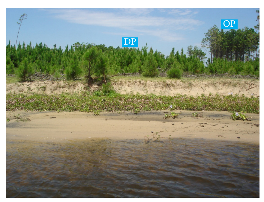
Figure SI-I.3 Natural dispersion of new pine trees (DP) and old pine forestry planting (OP) in permanent preservation areas of margin and dunes of Paurá Lagoon.

Highlighting the ecological importance of the Paurá lagoon area, a report from Bugin et al. (2015) related 21 plant species belonging to 14 families, mostly from restinga forest, but also from fields and dunes, classified into the 2014 national official lists of species endangered of extinction. Regarding endangered fauna species, the same report cites four species of annual fish ( Austrolebias minuano, Austrolebias wolterstorffi Cynopoecilus fulgens, Rivulus riograndensis ), three of felids ( Leopardus geoffroyi, Leopardus guttulus, Puma yagouaroundi ), two of rodends ( Ctenomys flamarioni, Ctenomys minutes, Dasyprocta azarae ), one of big-eared brown bat ( Histiotus velatus ), and one of mustelids ( Lontra longicaudis ) occurring in the study area.