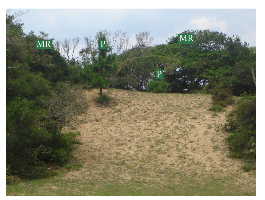
Figure SI-I 2) Pinus trees invading the native restinga forest. P – Pinus, MR – restinga forest. Figure SI-I 2) Exemplares de Pinus invadindo a mata de restinga. P – Pinus, MR – mata de restinga.

Katia Helena Lipp-Nissinen et al. (2018), Temporal dynamics of land use and cover in Paurá Lagoon region, Middle Coast of Rio Grande do Sul (RS), Brazil, Journal of Integrated Coastal Zone Management / Revista de Gestão Costeira Integrada , 18(1):25-40. [Supporting Information I]