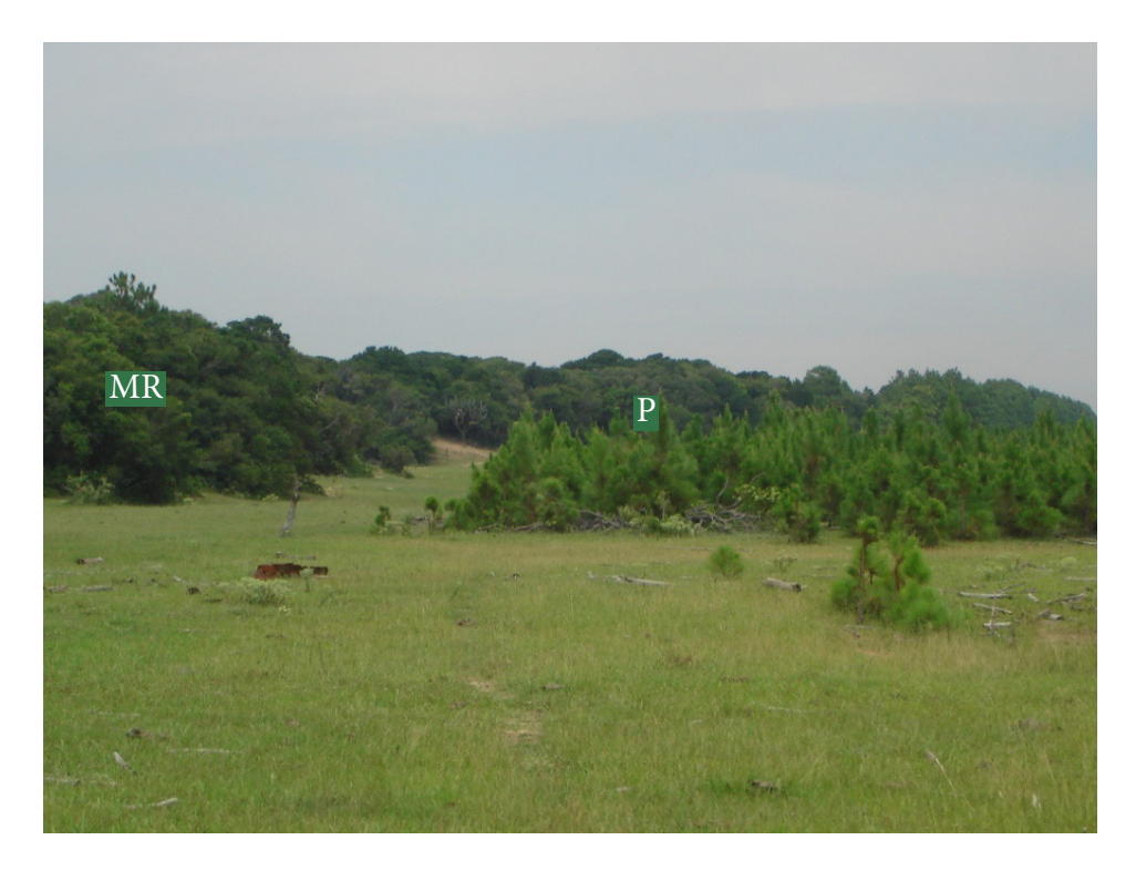
Figure SI-I 1) Proximity between Pinus trees dispersed from forestry plots and the native restinga forest. P – Pinus , MR – restinga forest.

Figura SI-I 1) Proximidade entre as árvores de Pinus dispersas do talhão de silvicultura e a mata de restinga. P – Pinus, MR – mata de restinga.