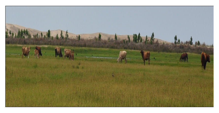
Figure SI-I.4 - Cattle grazing on field adjacent to Paurá Lagoon (foreground). Sequence towards the back: wet grassland/swamp, Pinus invaders and range of natural dunes.

Another impact factor on the study area is the presence of cattle grazing in the dry and wet fields and borders of the restinga forest (Figure SI-I.4). Besides cattle trampling, which affects mostly the development of herbaceous and shrubby plants in the field, the animals can cause various injuries to the trees, for example, by eating branches, leaves and reproductive parts, rubbing, lowering and breaking trunks or canopies to reach their apex for food.