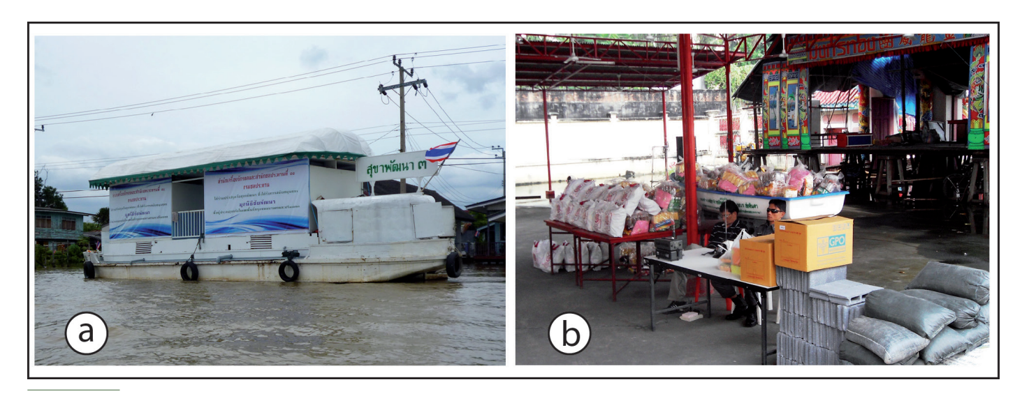
Figure 4. a) Mobile toilet in Ban Lad Kred organized by the village committee. b) Distribution of relief items by the military and the community organization in Ratchapa.

The majority of houses in Ratchapa are built on the land of the Marine Department without permission. This