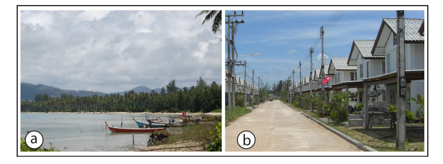
Figure 3. a) Small fishing boats and coconut plantation in Khao Lak. b) Newly built neighborhood in Ban Nam Khem after the tsunami. Figura 3. a) Pequenos barcos de pesca e plantação de coco em Khao Lak. b) Nova comunidade em Ban Nam Khem, construída depois do tsunami.

According to Berkes (2007) the Thai society had no social memory regarding tsunamis before 2004 except from some marginalized groups of indigenous fishing people. Accordingly most of the coastal dwellers didn't prepare themselves for a potential tsunami hazard at all. This was tragic because preparation is seen as a key factor in reducing negative impacts (Adger et al. 2005). In the aftermath of the tsunami preparation became a major concern on many levels. On the individual level people prepared folders with important documents, first aid kits, food and water, or flashlights to have it ready in case of an emergency. Furthermore people