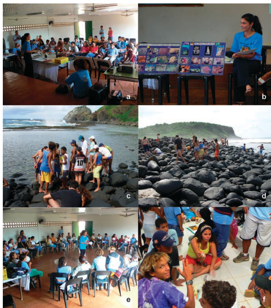
Figure 2 - a. Material used in the lectures for students at the Archipelago Public School, Fernando de Noronha. b. Illustration panels showing reef animals, as used at the Archipelago Public School, Fernando de Noronha. c. Guided tour at Atalaia Beach for students of the Archipelago Public School, Fernando de Noronha. d. Preparing for free diving at the reefs of Atalaia Beach, Fernando de Noronha. e. Activity on citizenship for students of the Archipelago Public School, Fernando de Noronha. f. Five-senses workshop carried out with students of the Archipelago Public School, Fernando de Noronha.