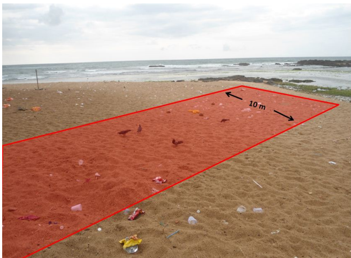
Figure 2 - Representation of the transect delimited for sampling station P10.

A 10 m-wide transect was delimited from the highest high water line to the end of the backshore, when encountering the first obstacle ( e.g. , vegetation, frontal dune, wall, construction), in each sampling station (Figure 2). All litter (> 2 cm) was collected and stored in duly identified plastic bags. Pieces smaller than 2 cm are relatively difficult to be systematically sampled without using any equipment and are not sampled at this time. Sampling occurred early in the morning to avoid possible direct interferences of municipal cleaning activities.